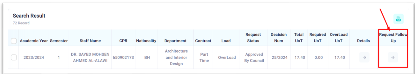
Figure 6 – Request Follow up